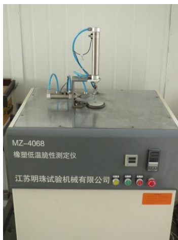
Low Temperature Tester