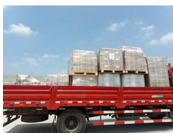
Send to Port