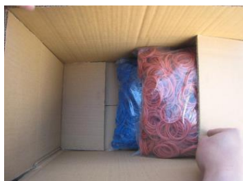
Carton Box Package