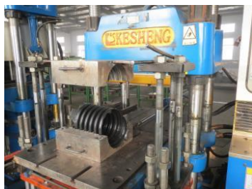
Rubber bellow Production