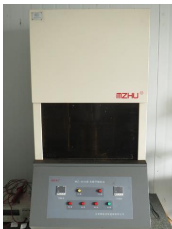
Roter Less Cure Meter