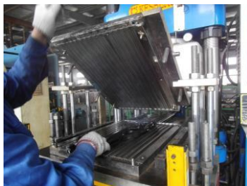
Rubber Strip Production